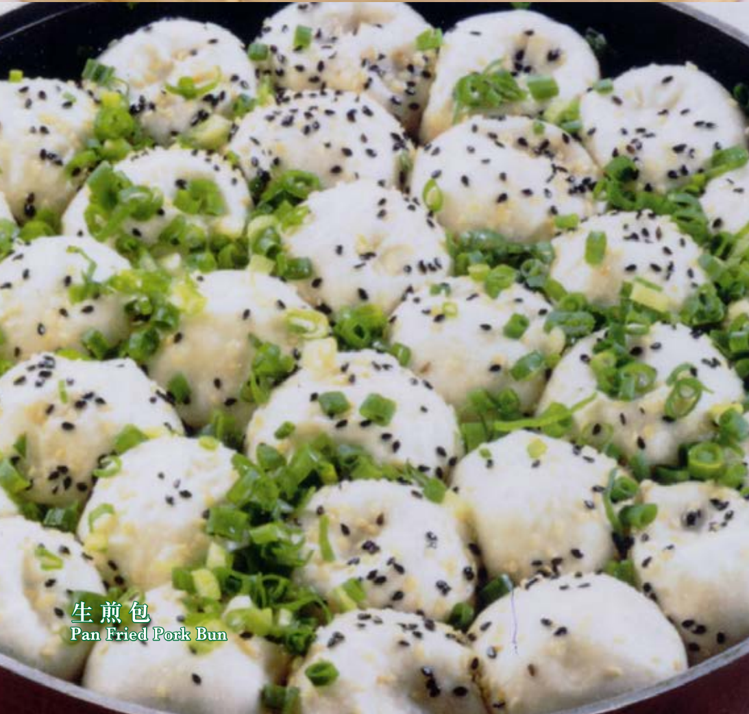
生煎包 Pan Fried Pork Bun