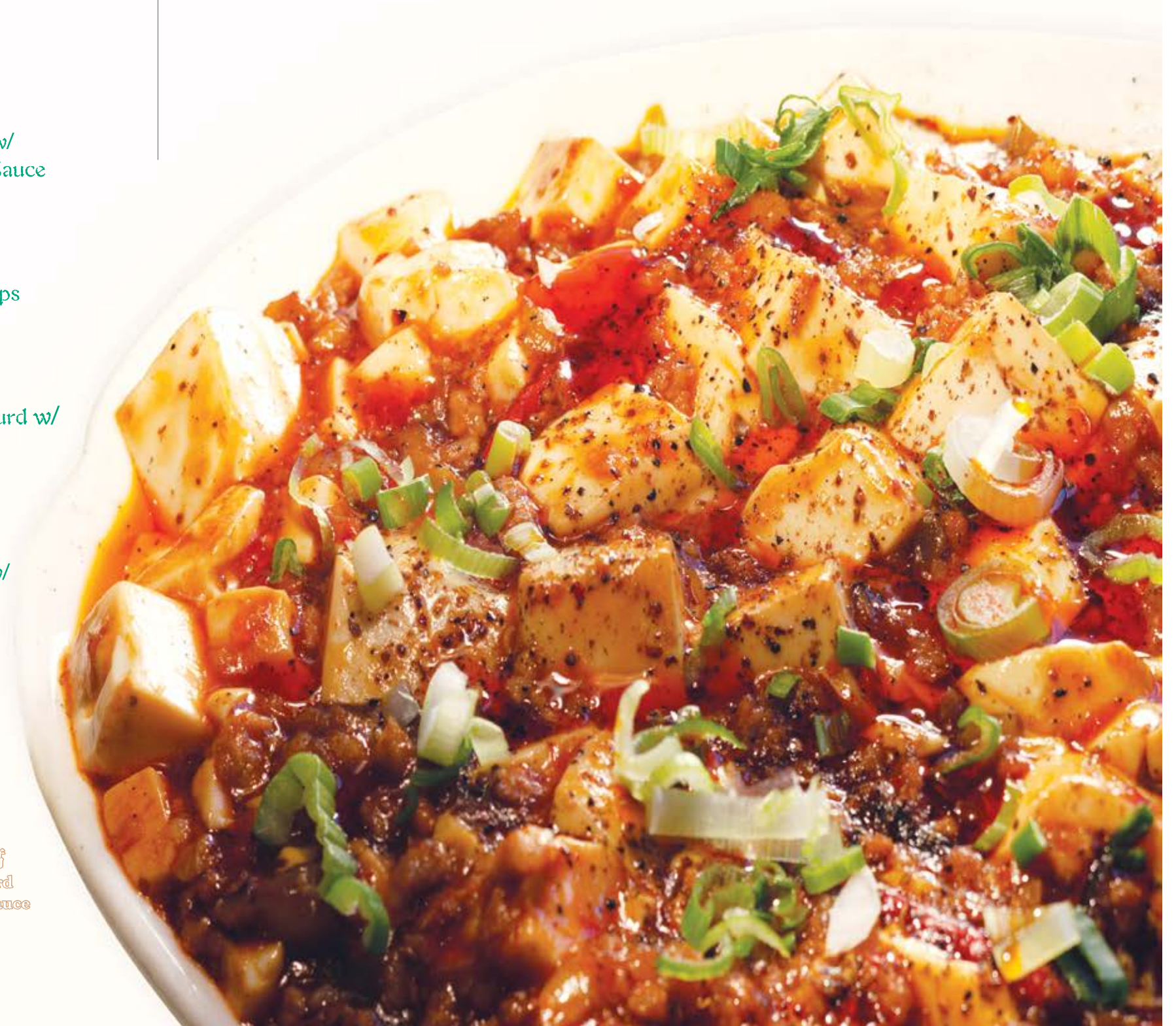
麻婆豆腐 Braised Bean Curd w/ Ground Pork Chili Sauce