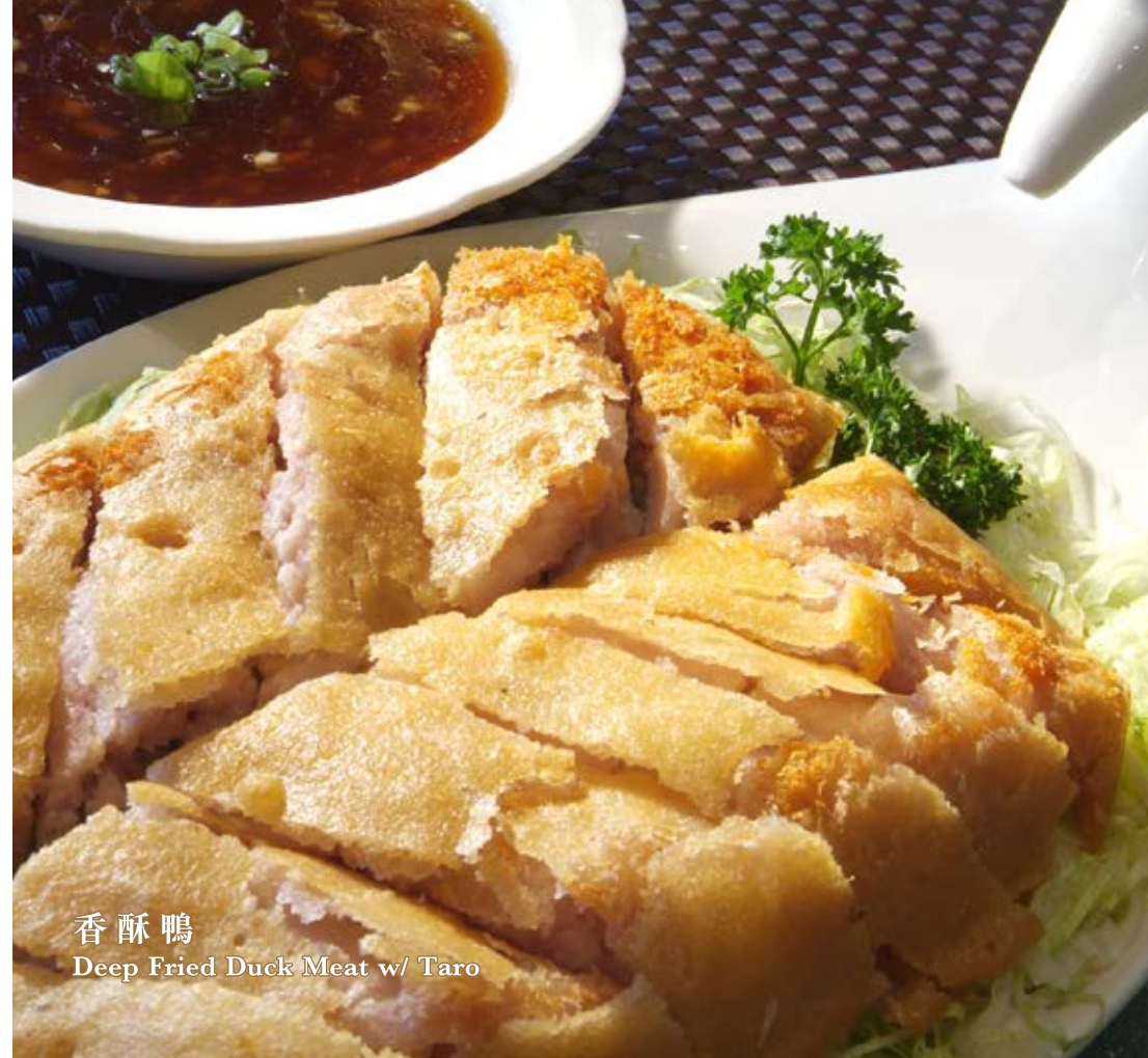
香酥鴨 Deep Fried Duck Meat w/ Taro