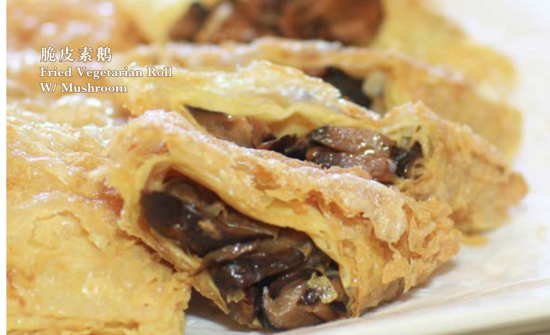
脆皮素鵝 Fried Vegetarian Roll W/ Mushroom