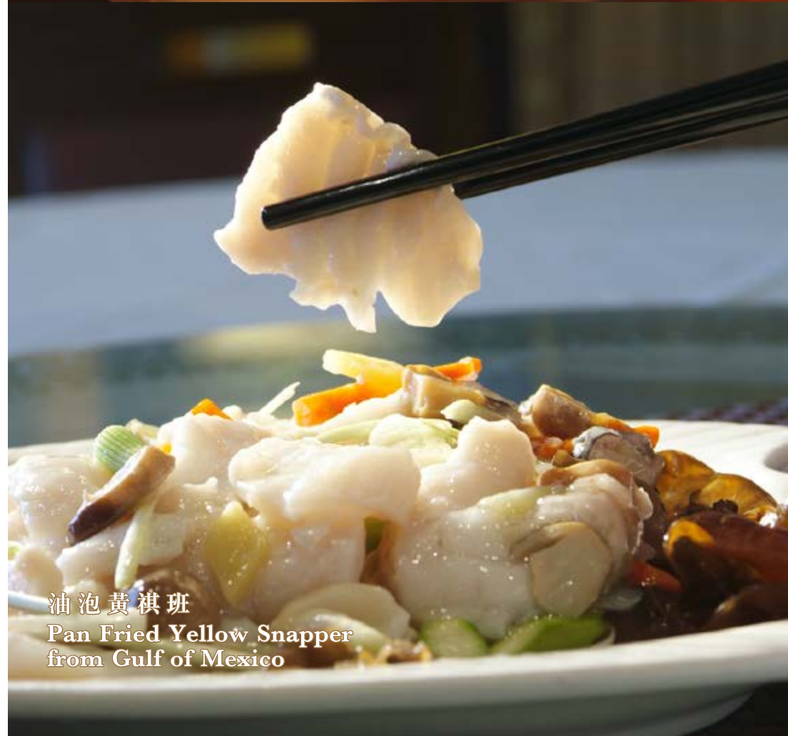
油泡黃旗班 Pan Fried Yellow Snapper from Gulf of Mexico