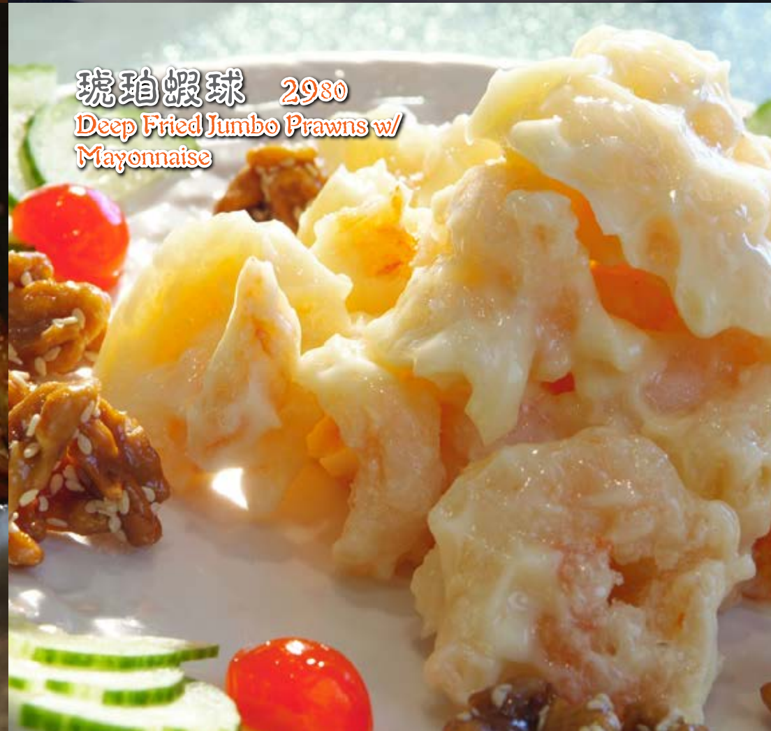
琥珀蝦球 2980 Deep Fried Jumbo Prawns w/ Mayonnaise