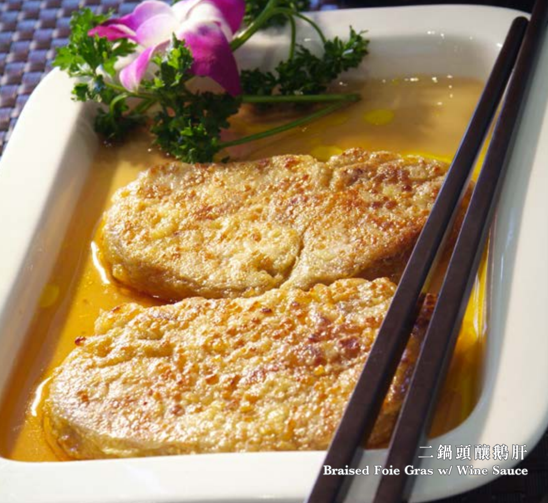
二鍋頭釀鵝肝 Braised Foie Gras w/ Wine Sauce