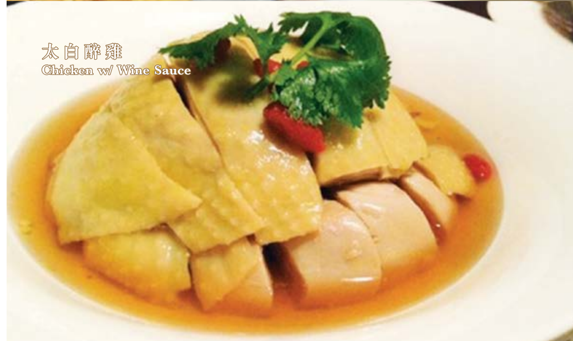
太白醉雞 Chicken w/ Wine Sauce