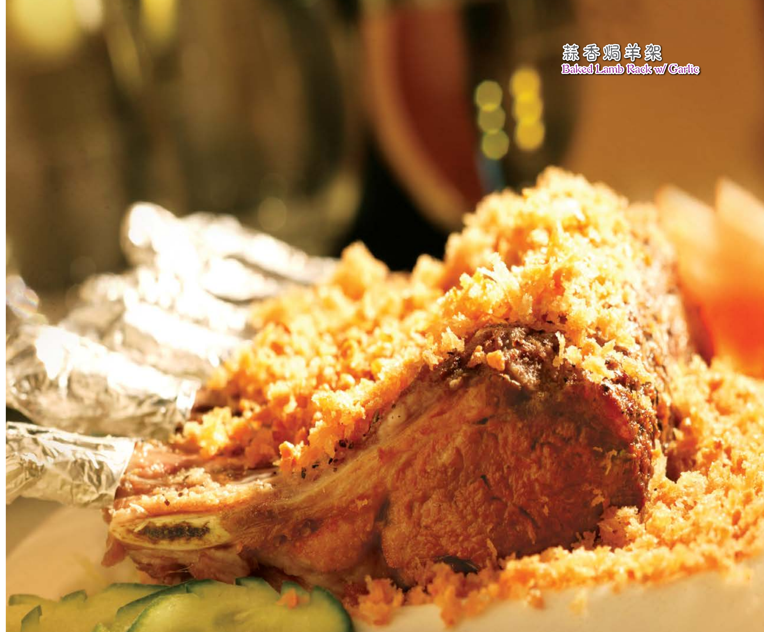
蒜香焗羊架 Baked Lamb Rack w/ Garlic