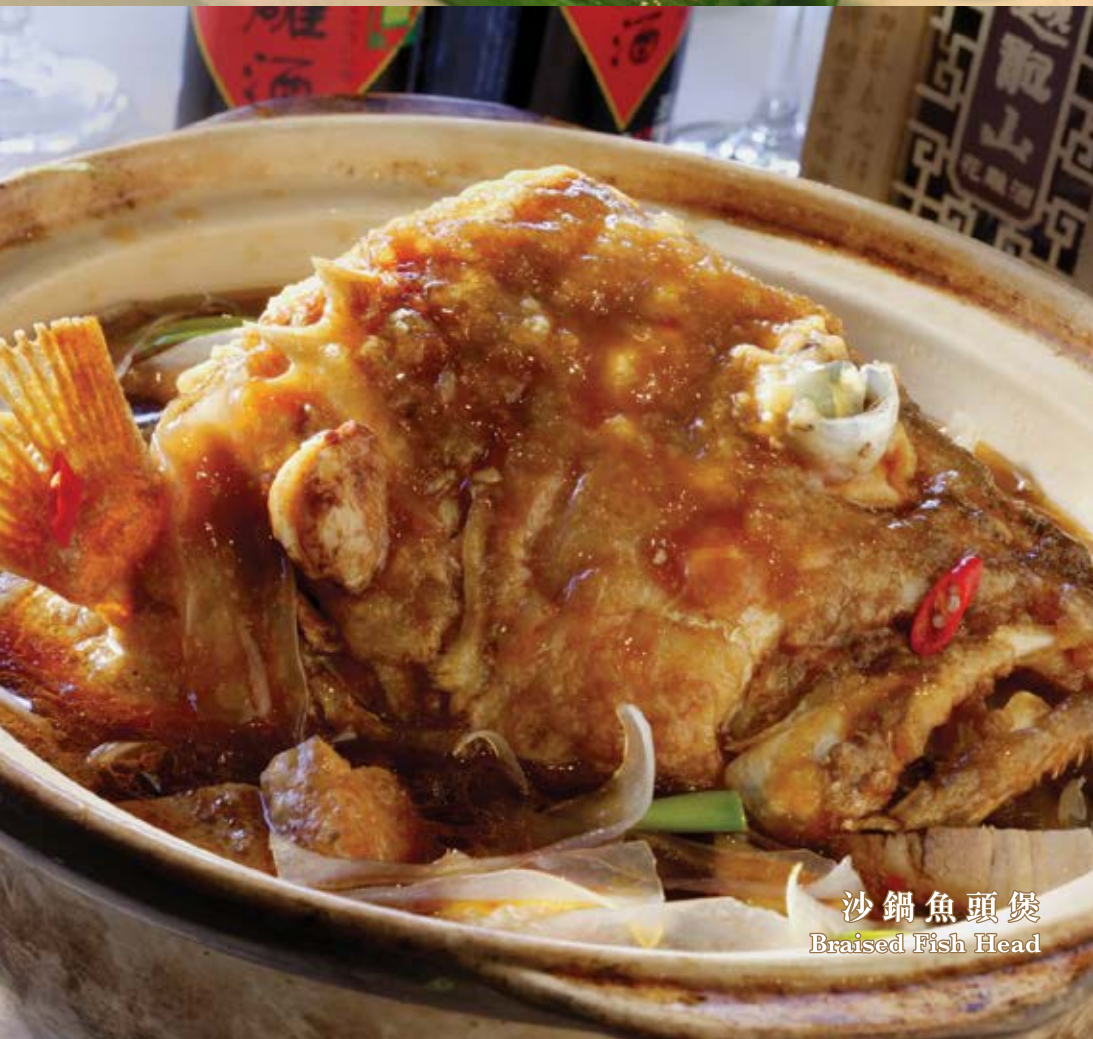
沙鍋魚頭煲 Braised Fish Head