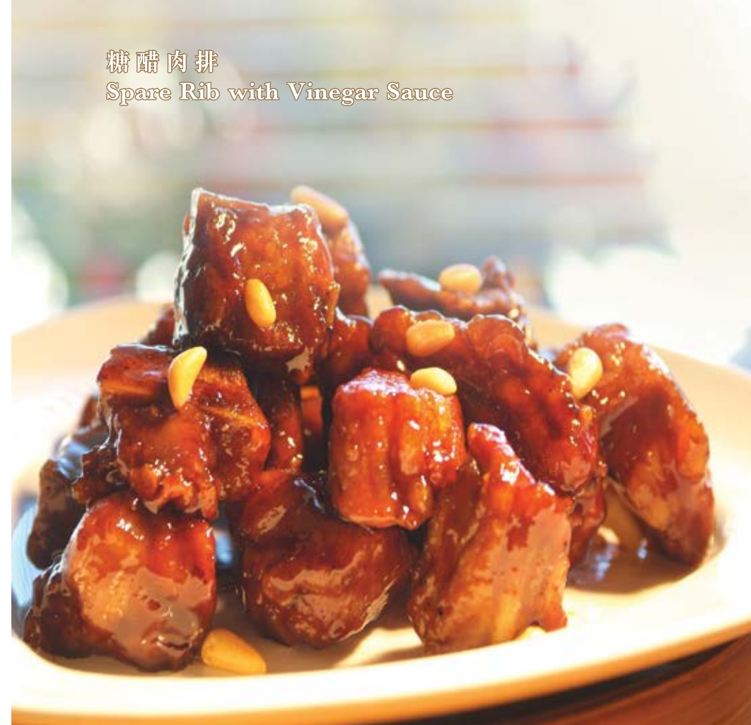
糖醋肉排 Spare Rib with Vinegar Sauce