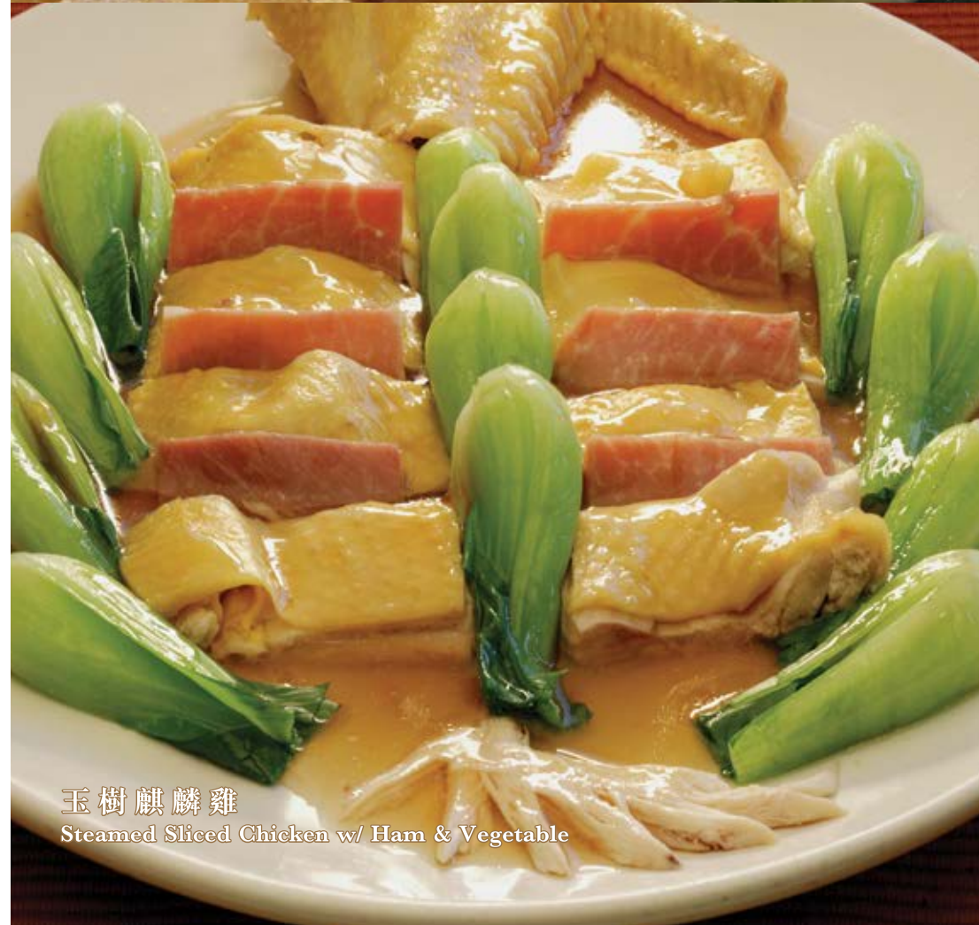
玉樹麒麟雞 Steamed Sliced Chicken w/ Ham & Vegetable