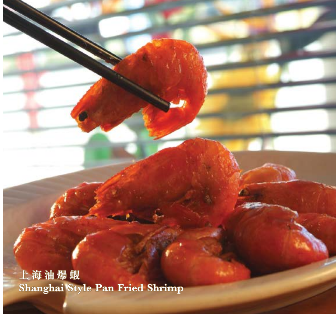
上海油爆蝦 Shanghai Style Pan Fried Shrimp

Steam Yellow Snapper with Ham & Vegetable 3680