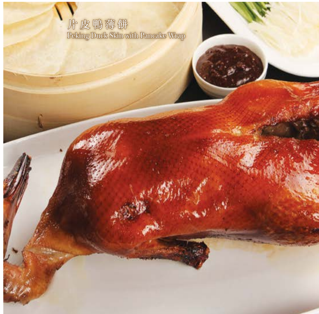
片皮鴨薄餅 Peking Duck Skin with Pancake Wrap

片皮鴨薄餅 • Peking Duck Skin with Pancake Wrap