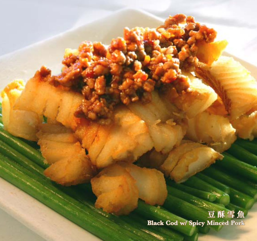
豆酥雪魚 Black Cod w/ Spicy Minced Pork