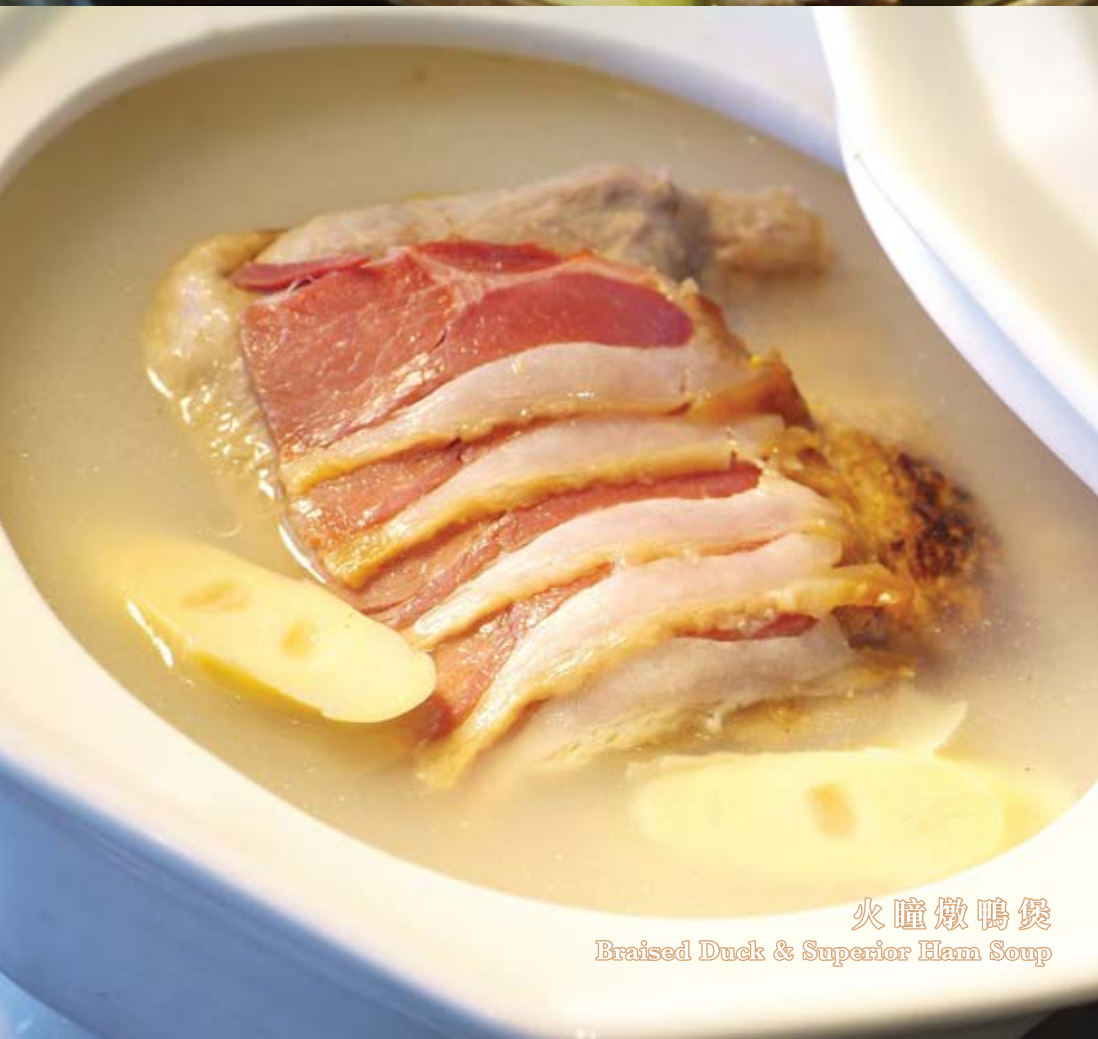
火瞳燉鴨煲 Braised Duck & Superior Ham Soup