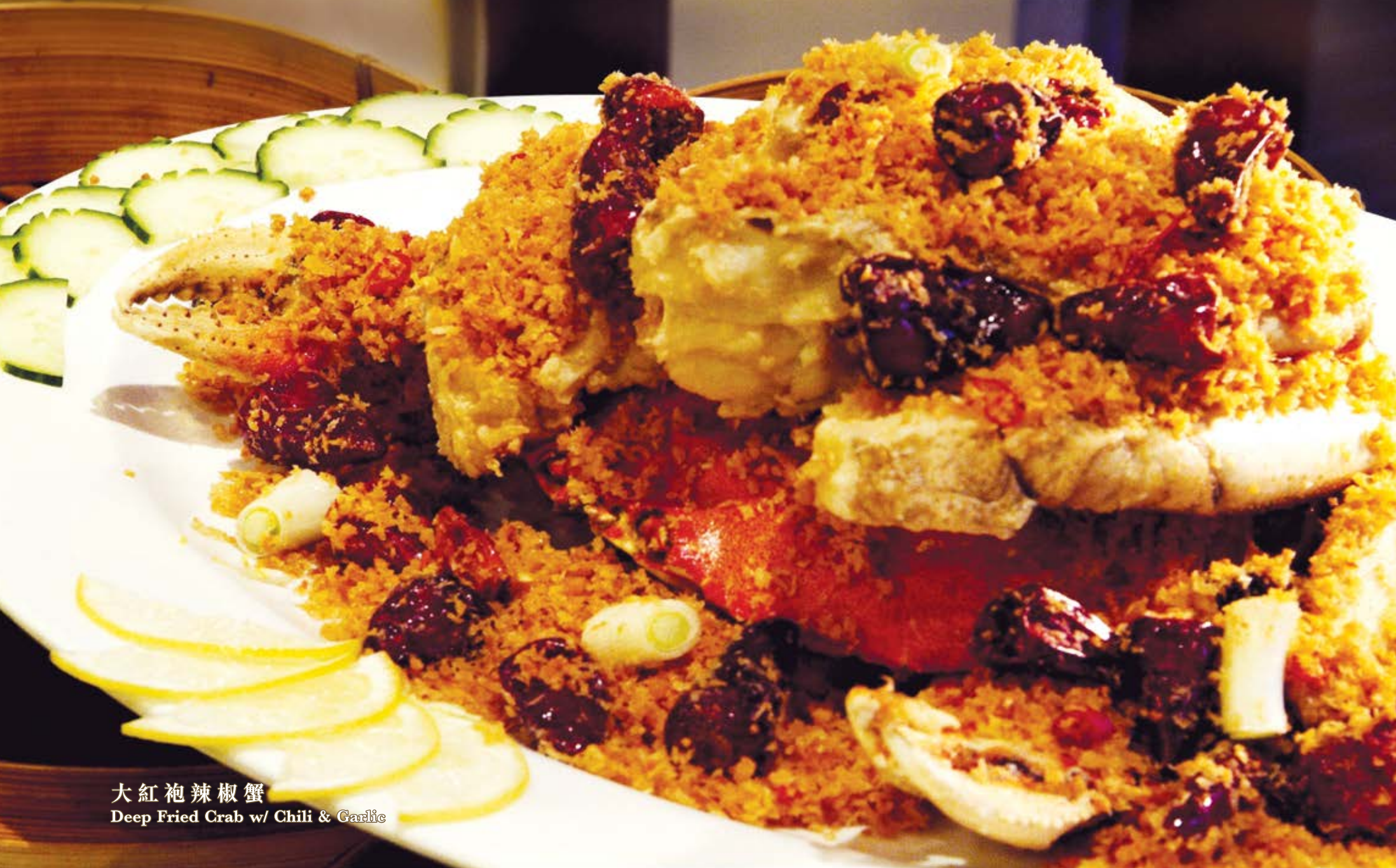
大紅袍辣椒蟹 Deep Fried Crab w/ Chili & Garlic