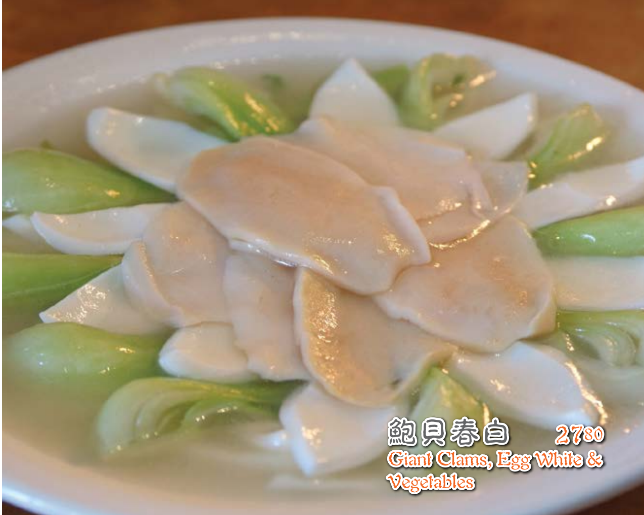
鮑貝春白 2780 Giant Clams, Egg White & Vegetables