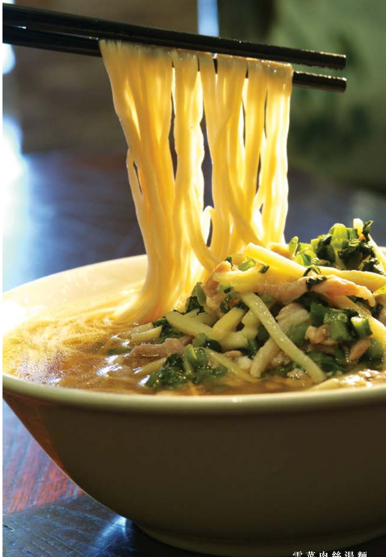
雪菜肉絲湯麵 Pickled Vegetable & Pork Noodles in Soup