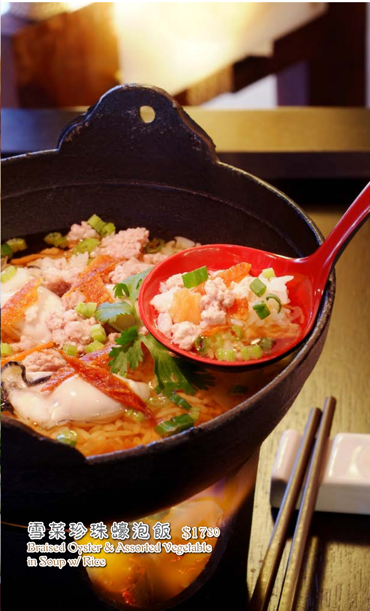
雪菜珍珠蠔泡飯 $1780 Braised Oyster & Assorted Vegetable in Soup w/ Rice