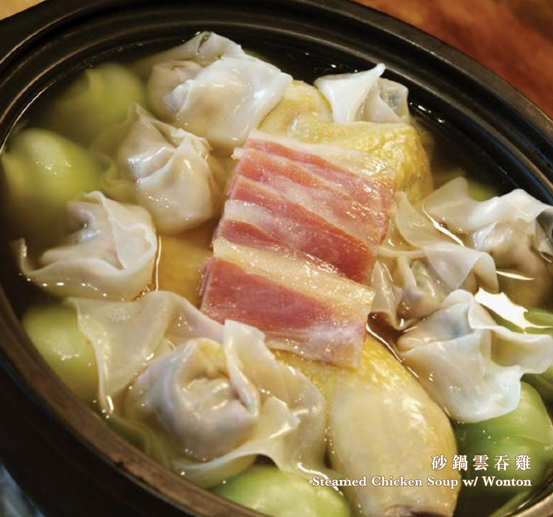
砂鍋雲吞雞 Steamed Chicken Soup w/ Wonton