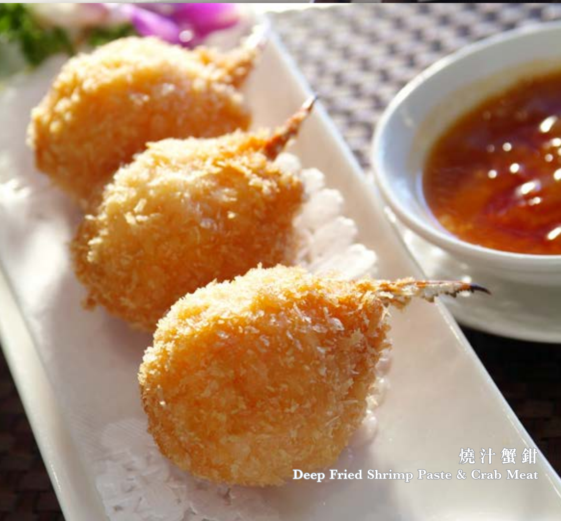
燒汁蟹鉗 Deep Fried Shrimp Paste & Crab Meat