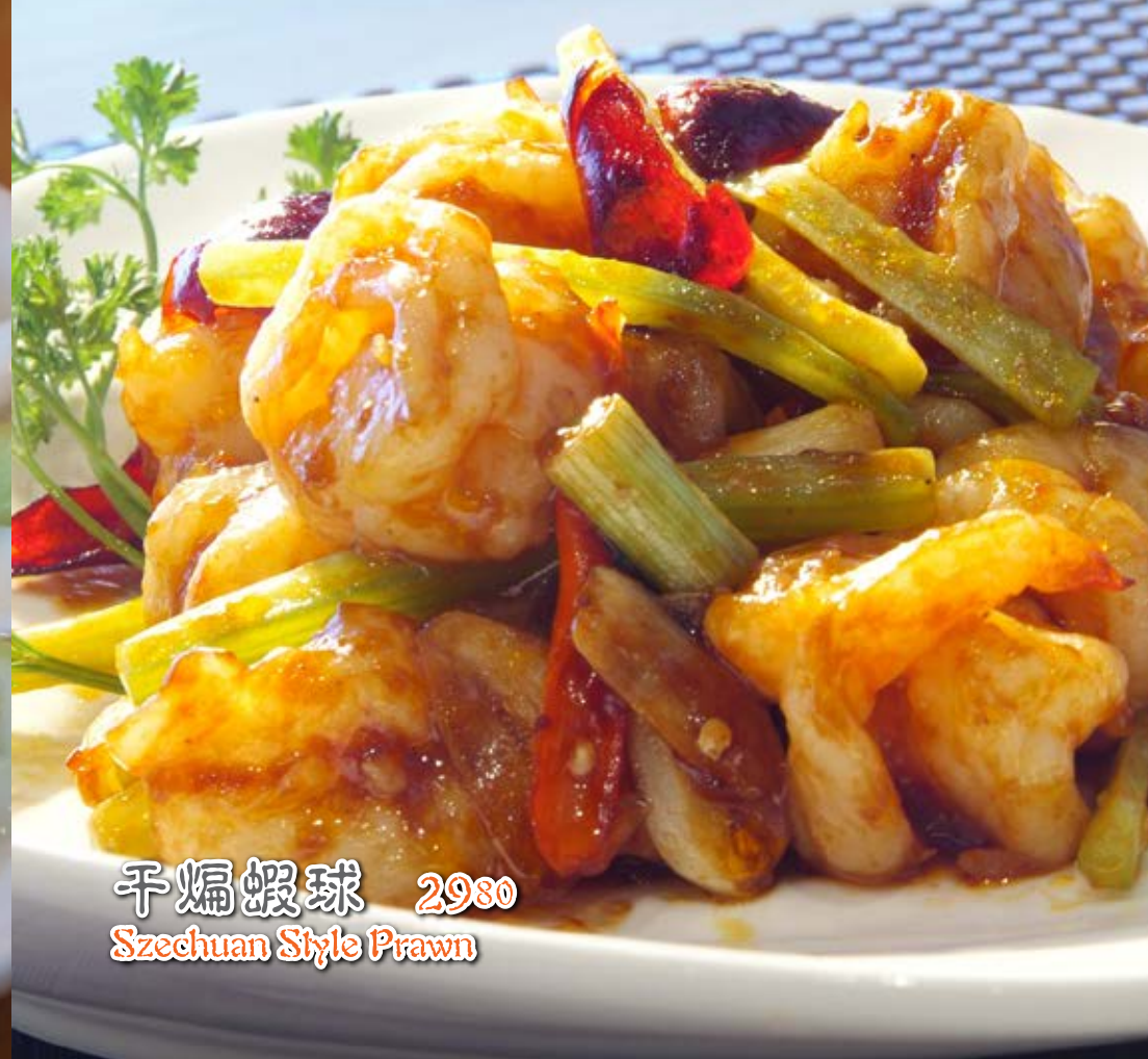
干煸蝦球 2980 Szechuan Style Prawn