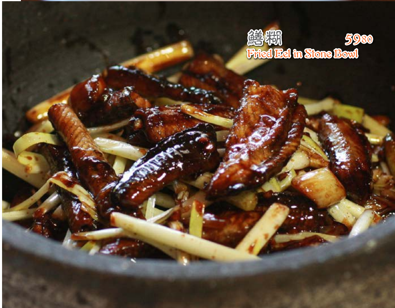
鱧糊 5980 Fried Eel in Stone Bowl