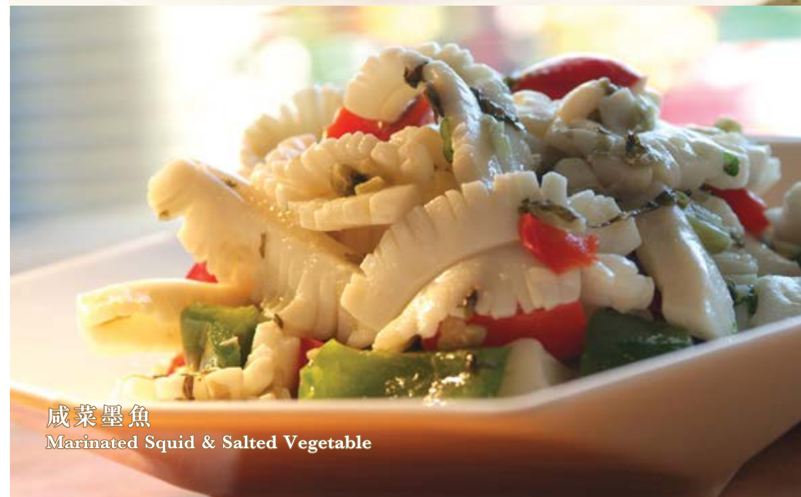
咸菜墨魚 Marinated Squid & Salted Vegetable