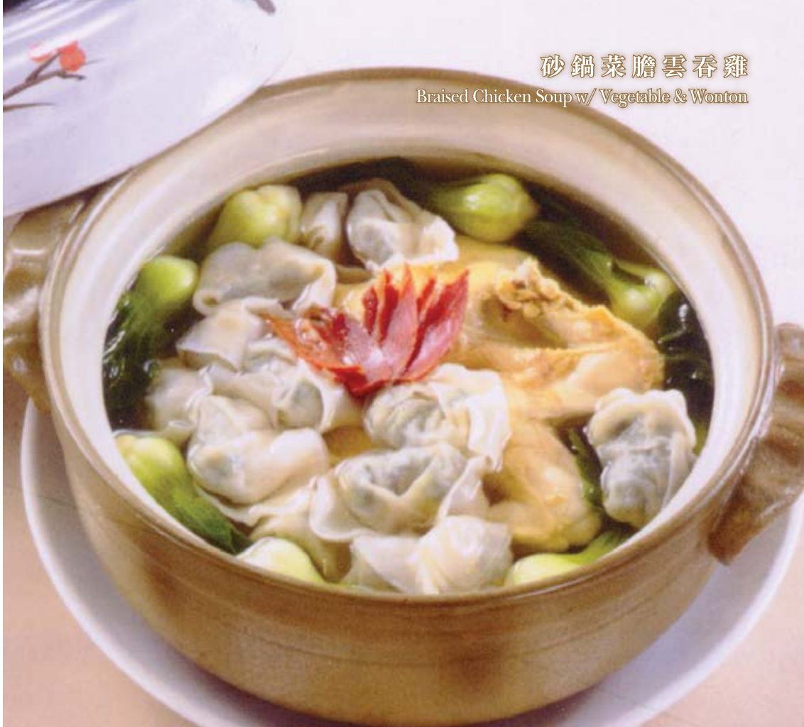
砂鍋菜膽雲吞雞 Braised Chicken Soup w/ Vegetable & Wonton