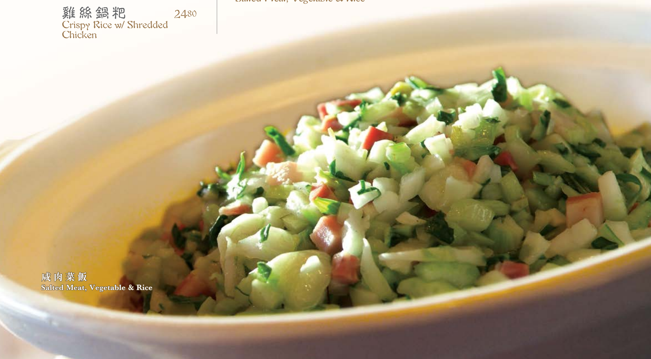
咸肉菜飯 Salted Meat, Vegetable & Rice

上海炒年糕 2080 Fried Shanghai Style Rice Cake