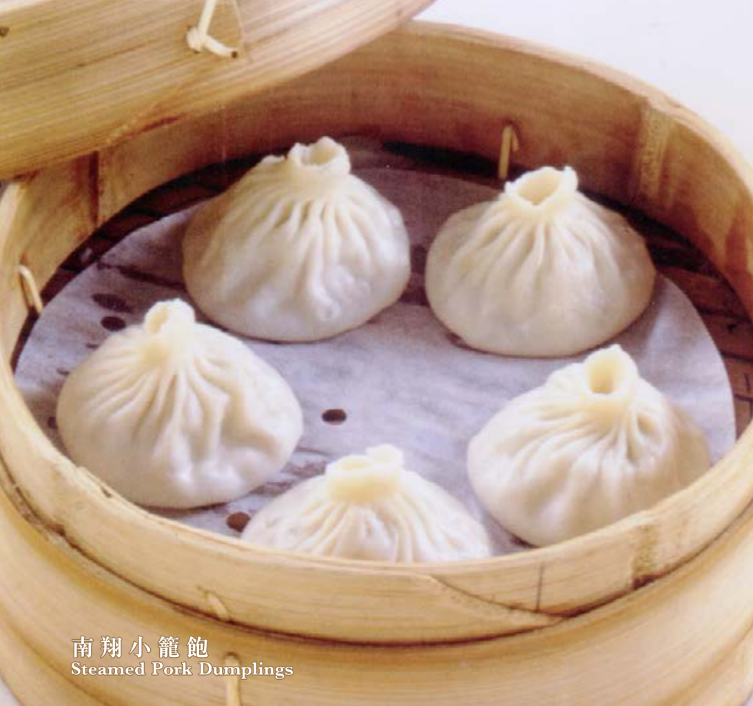
南翔小籠飽 Steamed Pork Dumplings