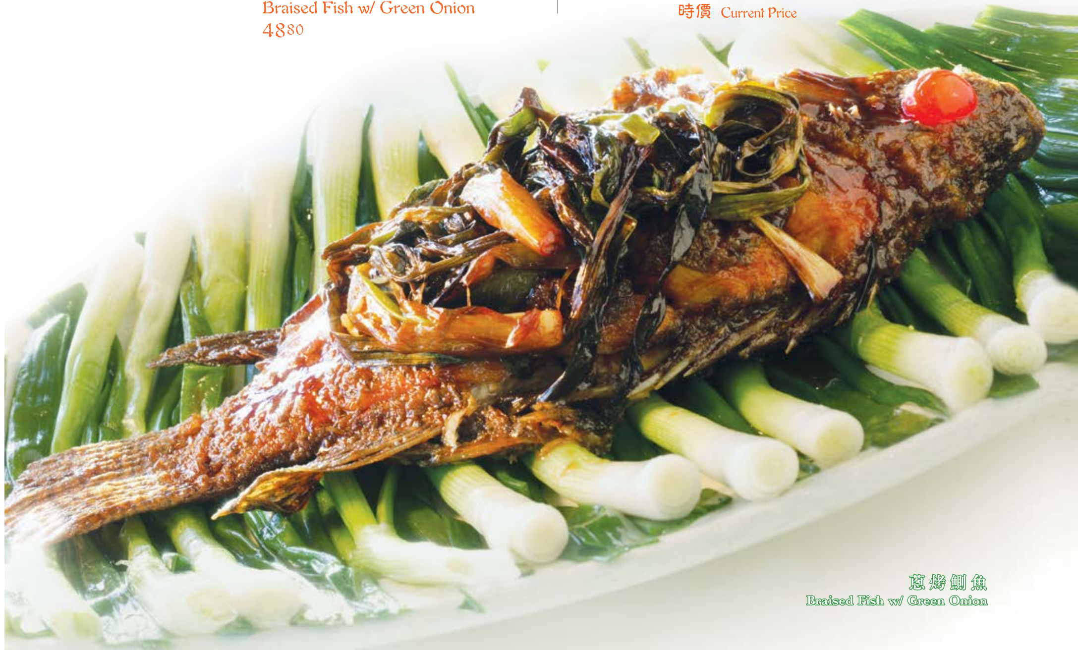
蔥烤鰱魚 Braised Fish w/ Green Onion

油泡雙蚌 Pan Fried Geo Duck & Osmanthus Mussels 時價 Current Price