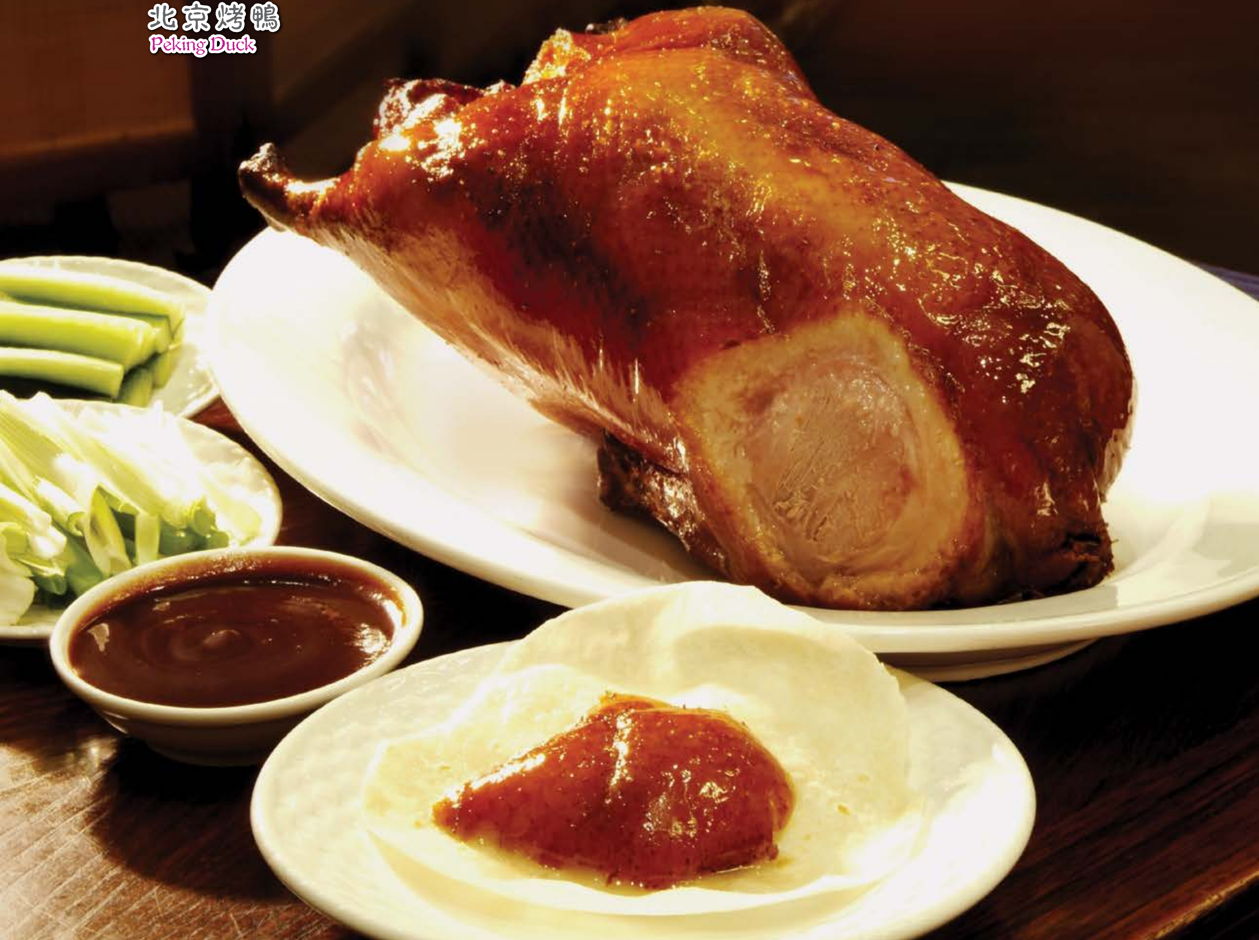
北京烤鴨 Peking Duck